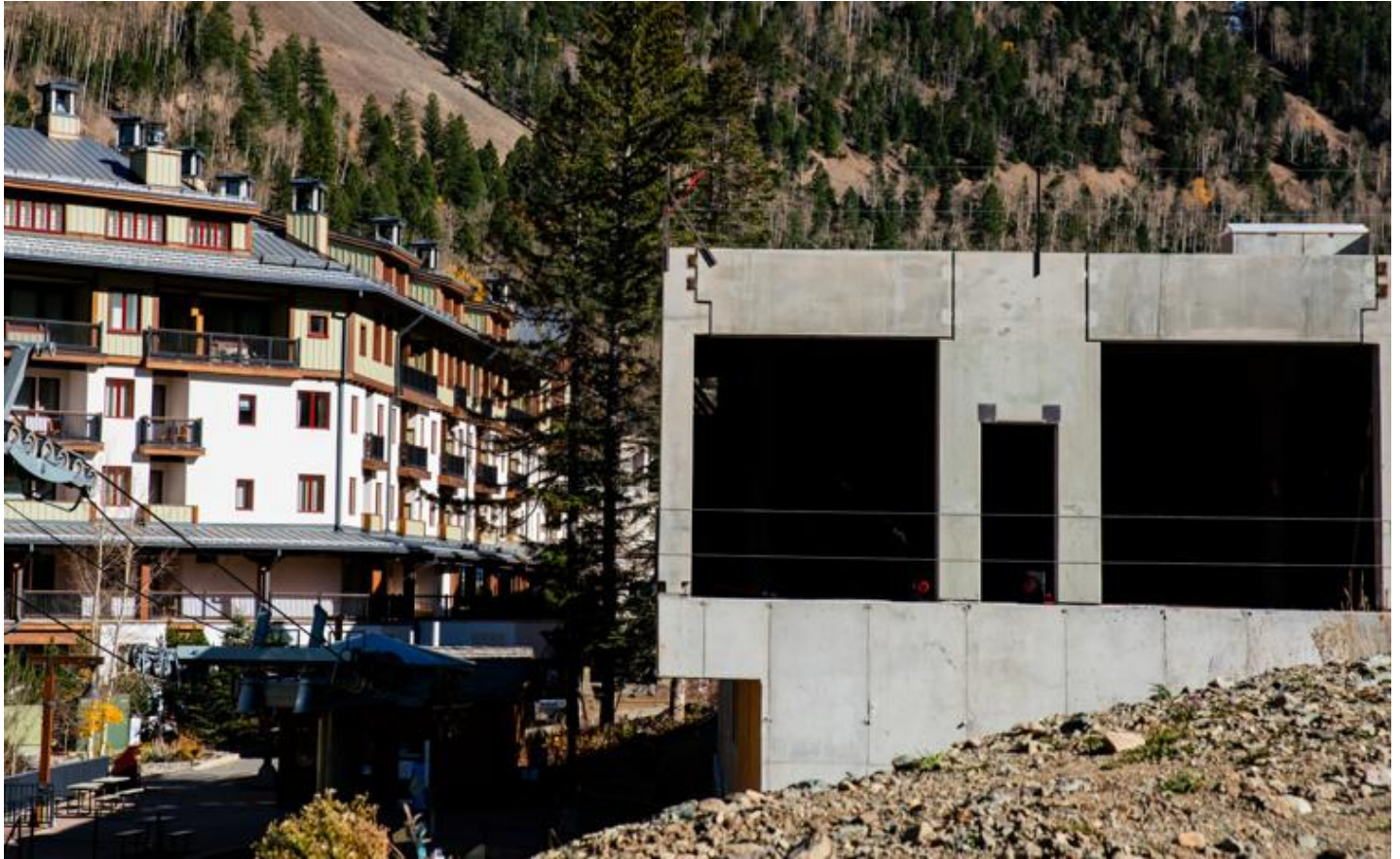
The Hotel St. Bernard rises next to The Blake, left, in Taos Ski Valley.

"We're in negotiations with TSV over the issues; we're looking for a solution," he said.